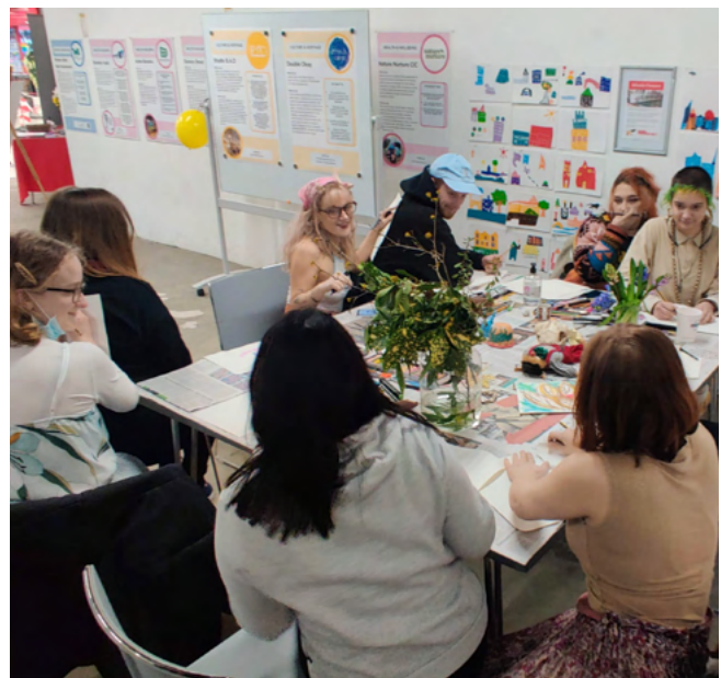
Figure 5: Week 2 - Art Therapy: Life drawing on experiencing grief with Oxford Community Centre