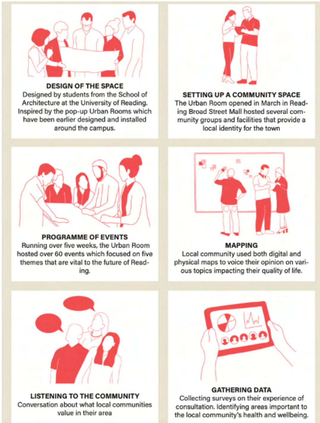
Figure 10: Co design process of the urban room with local community