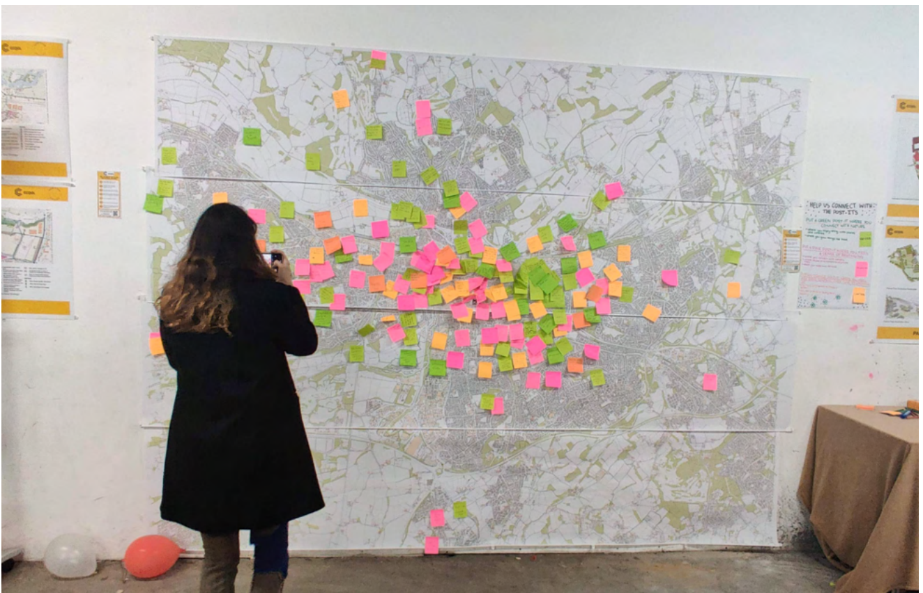
Figure 9: The Interactive board for visitors to make their comments about places they enjoy in Reading using post it notes