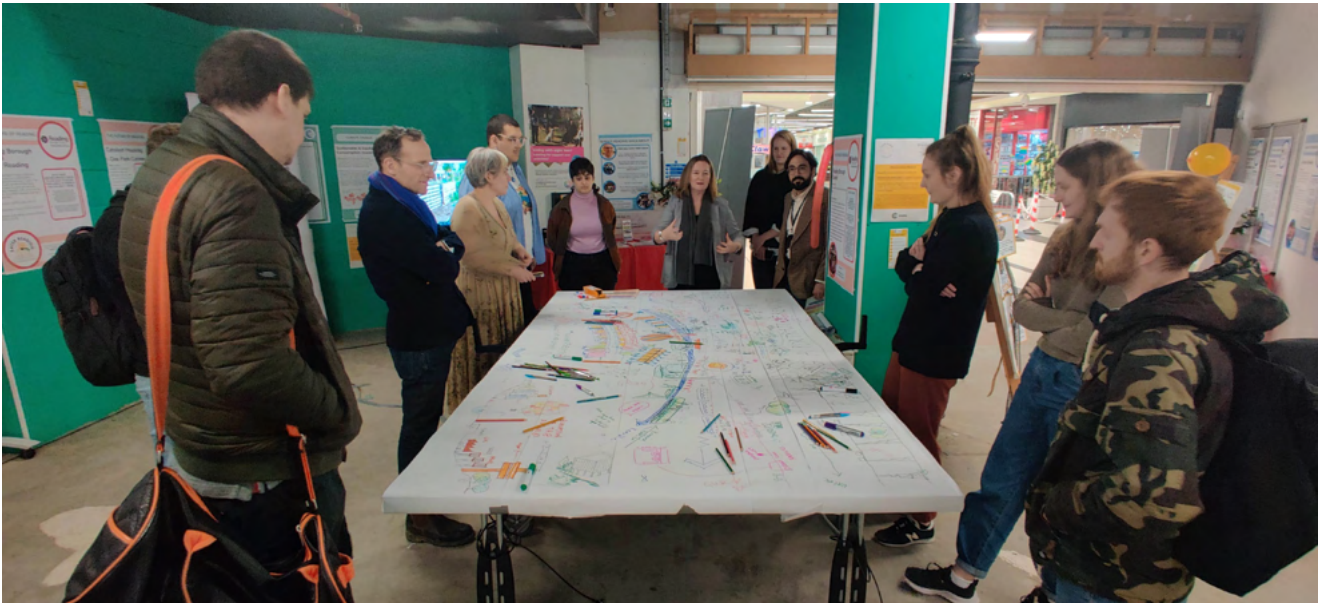
Figure 6: Week 3 - Portrait of Reading - interactive workshop by the group Future City on the Future of Reading station with students from the University of Reading