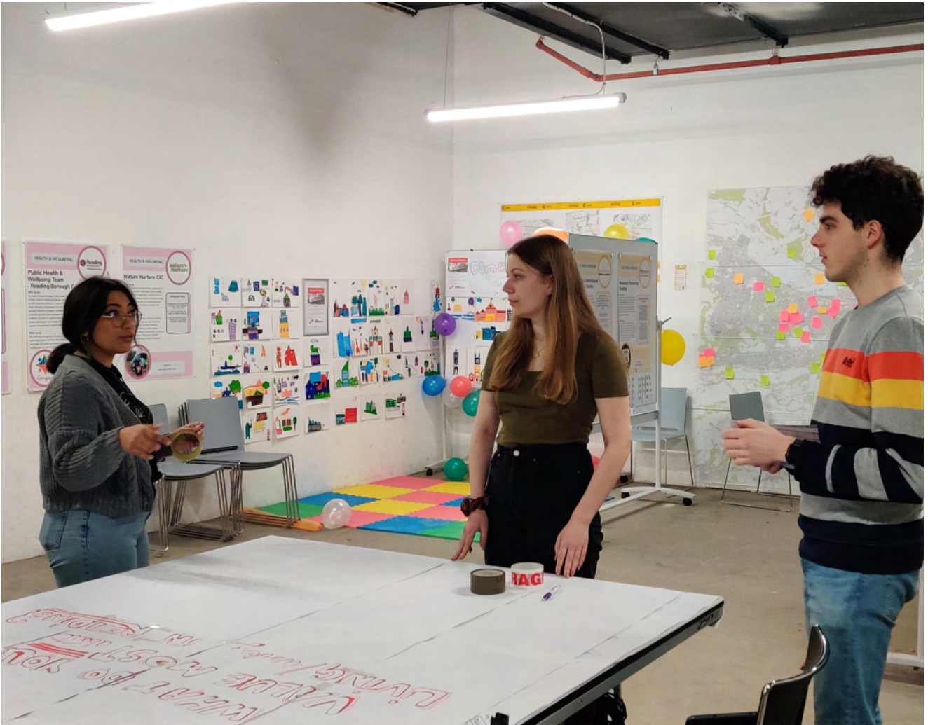
Figure 11 Students from University of Reading worked with community groups to support workshops