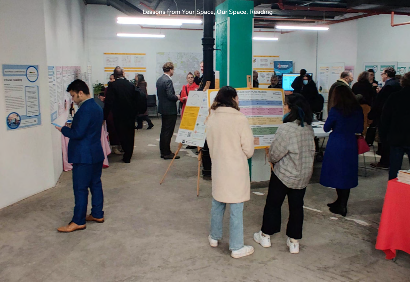
Figure 1: The opening of the urban room at Reading March 2022