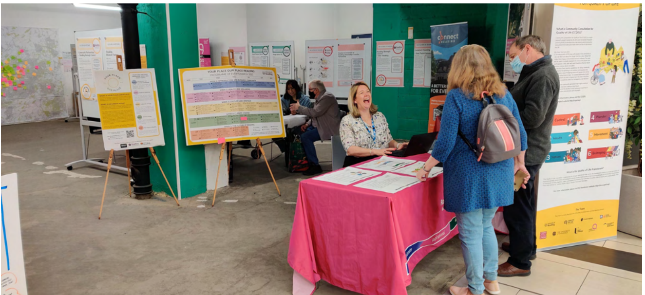
Figure 7: Week 4 - Climate change and Royal Berkshire hospital consultation