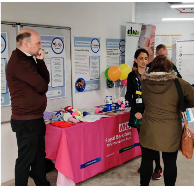
Figure 4: Week 1 - Royal Berkshire hospital drop in session to discuss new building