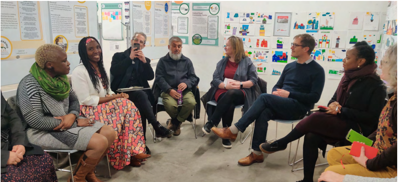
Figure 8: Week 5 - Reading Quality of Life Workshop with the Quality of Life Foundation