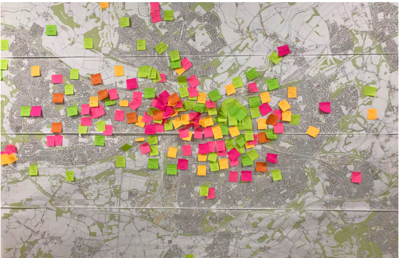
Figure 12: Map of Reading with communities marking out places that they value

A key message from all our collaborators is to engage communities early in the planning process and to provide a permanent place for community discussions, a place that the community can use as a reference point for information about the future of their towns and places, where they can make a difference.