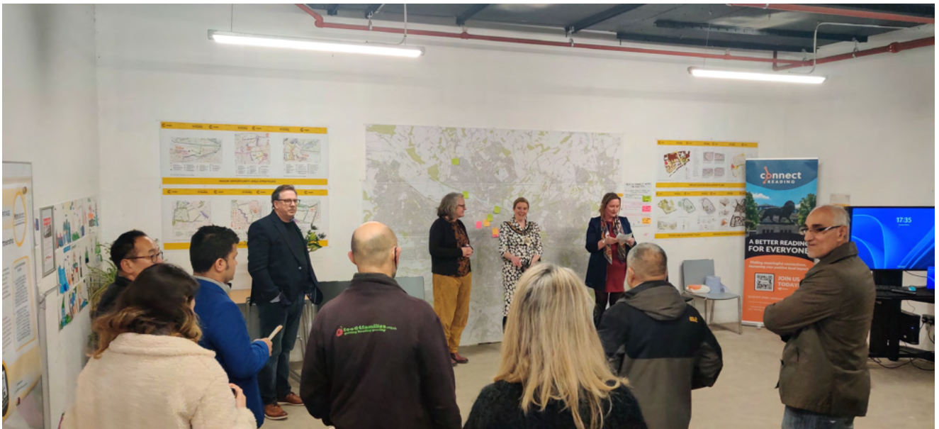
Figure 2: Opening ceremony of urban room at Reading attended by leaders of community groups and the mayor and councillors

The urban room has shown that there is a great deal of local community interest and pride in their town. There were over 40 posters from local groups describing what they do - from organisations passionate about the environment, such as Ethical Reading, to community support groups. Others held discussions and contributed to the programme of community-focused events.