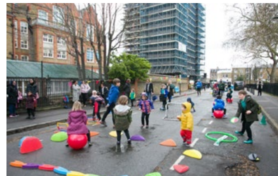
School Streets.