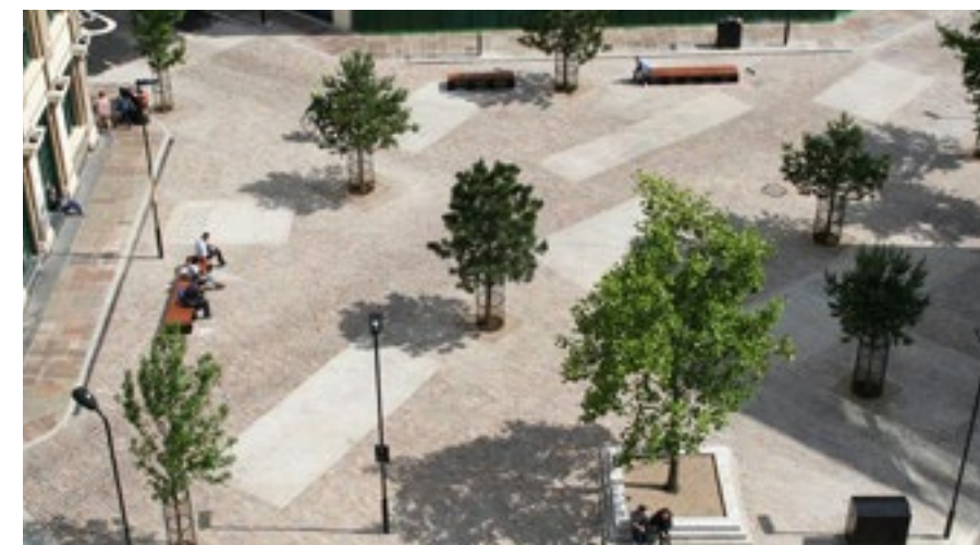
Transport Strategy.

- CLLR JON BURKE, CABINET MEMBER FOR ENERGY, WASTE, TRANSPORT AND PUBLIC REALM