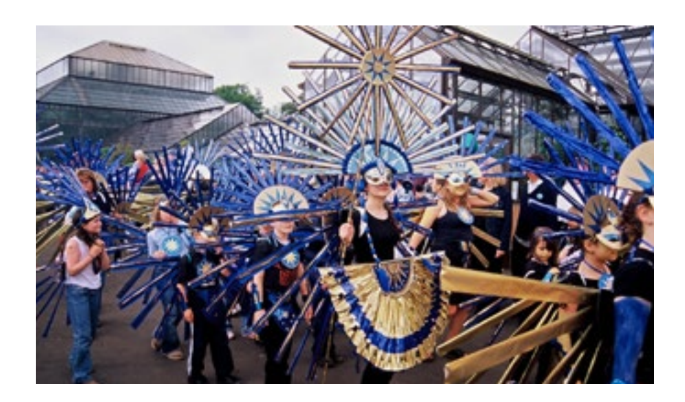
Glasgow's West End Festival